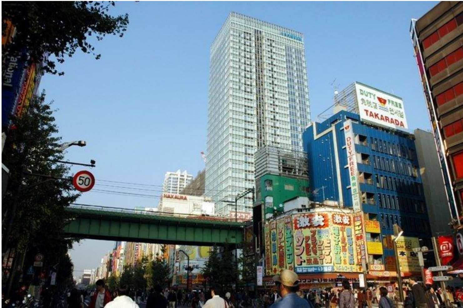
Akihabara [the famous electronic town] and IT facility “Akibahara Cross Media”