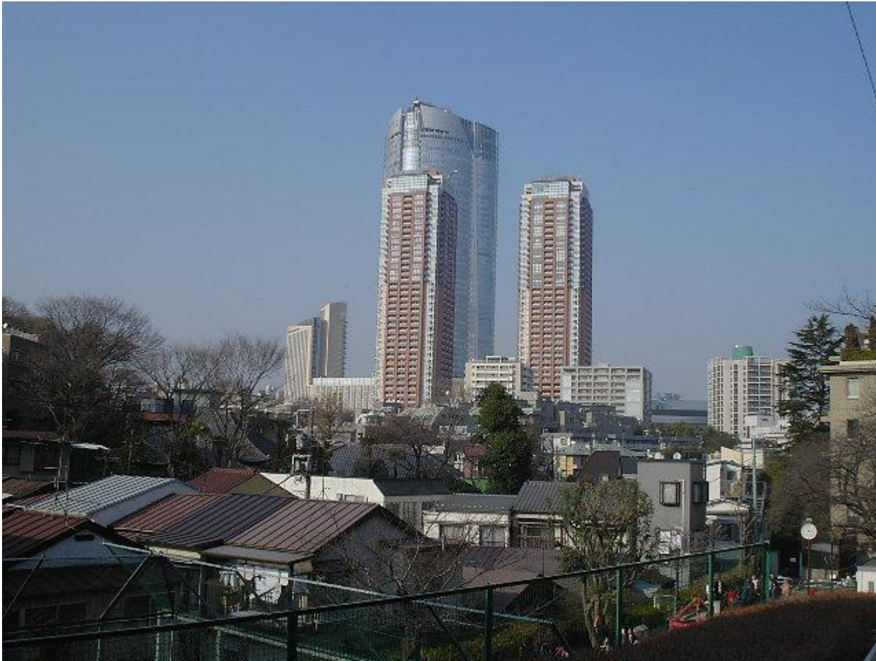
Roppongi Hills and downtown streetscape