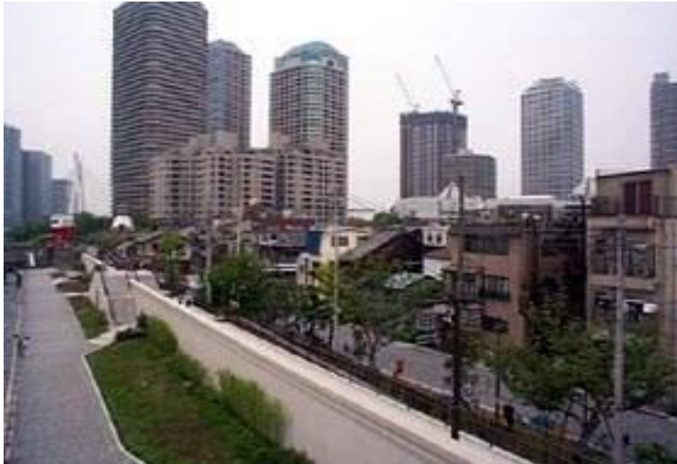
The Old town of TSUKUDAZIMA island and New town (Okawabata-River City)